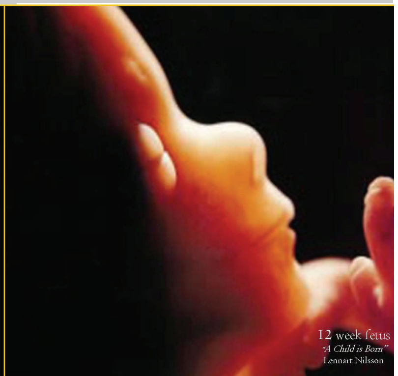
12 week fetus "A Child is Born" Lennart Nilsson