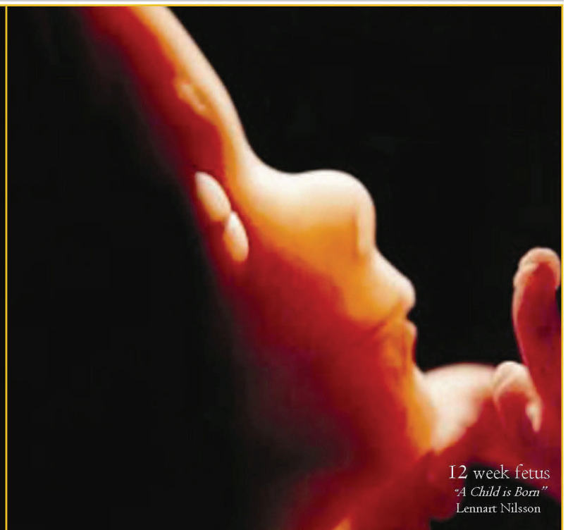
12 week fetus "A Child is Born"

Be their Voice at the University of California!