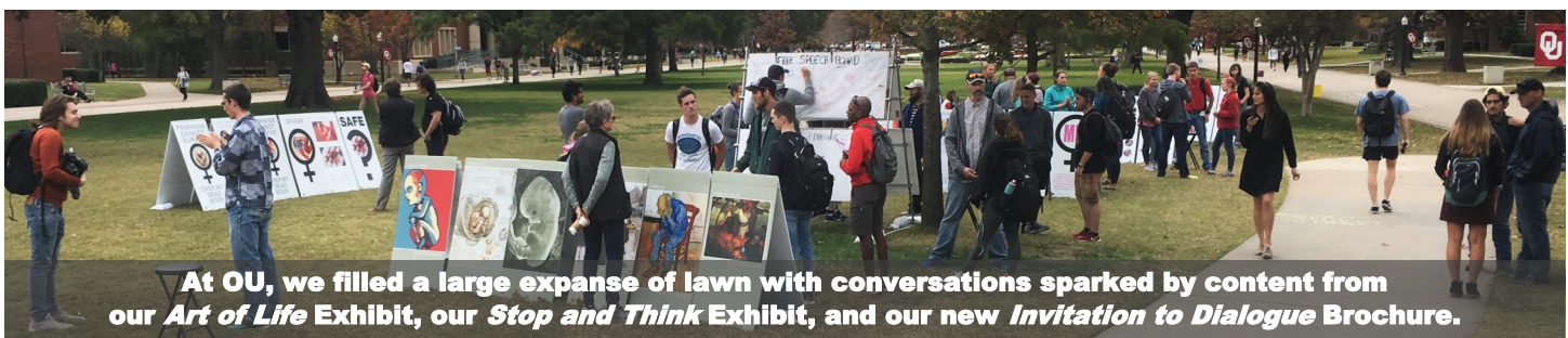
At OU, we filled a large expanse of lawn with conversations sparked by content from our Art of Life Exhibit, our Stop and Think Exhibit, and our new Invitation to Dialogue Brochure.